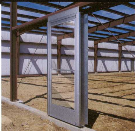
Metal building application.