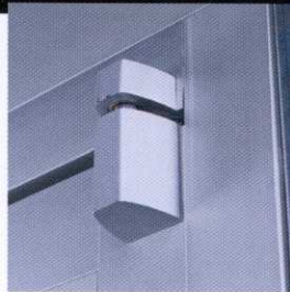
Offset pivot hinge.